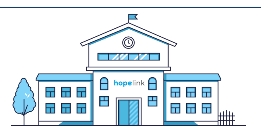
5,970 total served