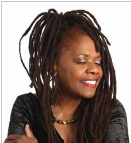
Catherine Russell headlines the 2017 Bellevue Jazz & Blues Festival on Friday, June 2.

Every Thursday, May 18 to October 12 3 - 7 p.m. 1717 Bellevue Way NE (parking lot of Bellevue Presbyterian Church) 425-454-8474