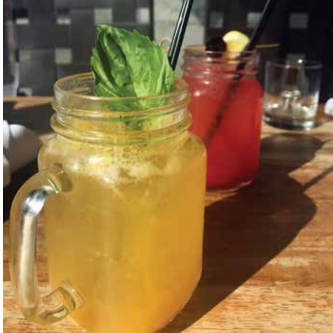
Photo: Lot No. 3's shrub cocktail-mocktail

At Café Cesura opposite barre3, cool down with a pom green iced tea, their popular warm-weather brew, or the rooibos chai latte, a winning choice for the caffeine-free. Closer to Old Bellevue is cozy T'Latte , a community-driven café that offers goods like bubble tea—also called boba—in your choice of flavors like lychee, jasmine