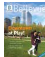
Bellevue Downtown Park, a 21-acre oasis in the heart of Downtown