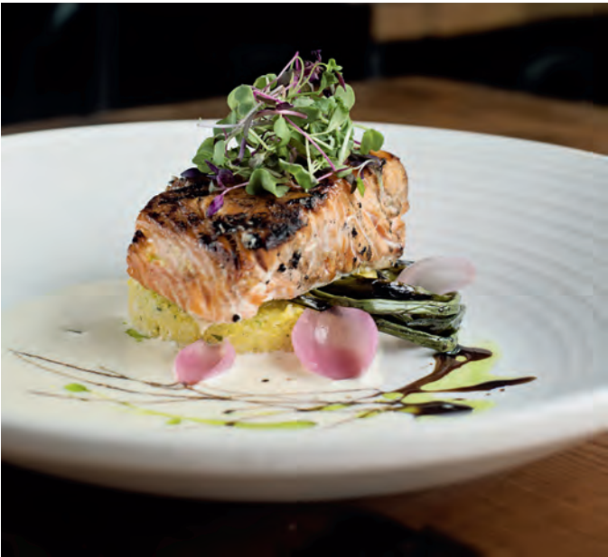
Opposite page: Bellevue Botanical Garden. Above: Fran’s Decadent Drinking Chocolate. 99 Park Restaurant. Below: KidsQuest Children’s Museum Spooktacular Puppet Theater. Mike Holmgren from KJR 950 Mike Holmgren show.

It’s that time of year again — football season! If you are unable to make it to CenturyLink Field, Downtown Bellevue has many great football watching venues. At 520 Bar and Grill their seven TVs are always tuned in to the Seahawks and Huskies games. Every Thursday during football season swing by to see (and hear) the live broadcast of The Mike Holmgren Show, airing 3 – 5 p.m. on 950 KJR-AM. They take reservations and serve their happy hour menu during games. Bellevue Brewing Company has a 19’x10’ projection wall and 6 additional monitors for viewing pleasure. During the game enjoy one — or two — of their highly anticipated fall beers including a new KZOK beer, Fresh Hop Ale and Double Red IPA. Plan ahead and reserve their hospitality room for private viewing. Have fun, be safe and arrive early to fully enjoy your game day!